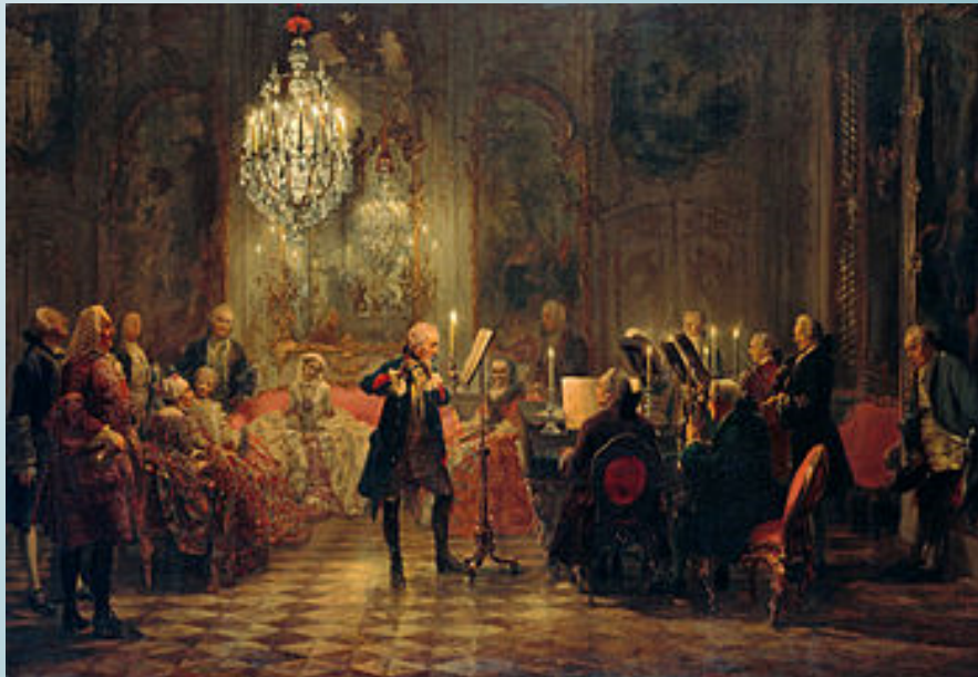
The Flute Concert of Sanssouci by Adolph Menzel 1852, depicts Frederick playing the flute in his music room. Bach accompanies him on the harpsichord .